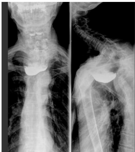
Figure 1 Contrast examination of the esophagus revealed the presence of a large Zenker's diverticulum causing dysphagia.